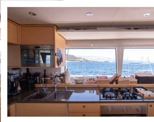
galley & saloon