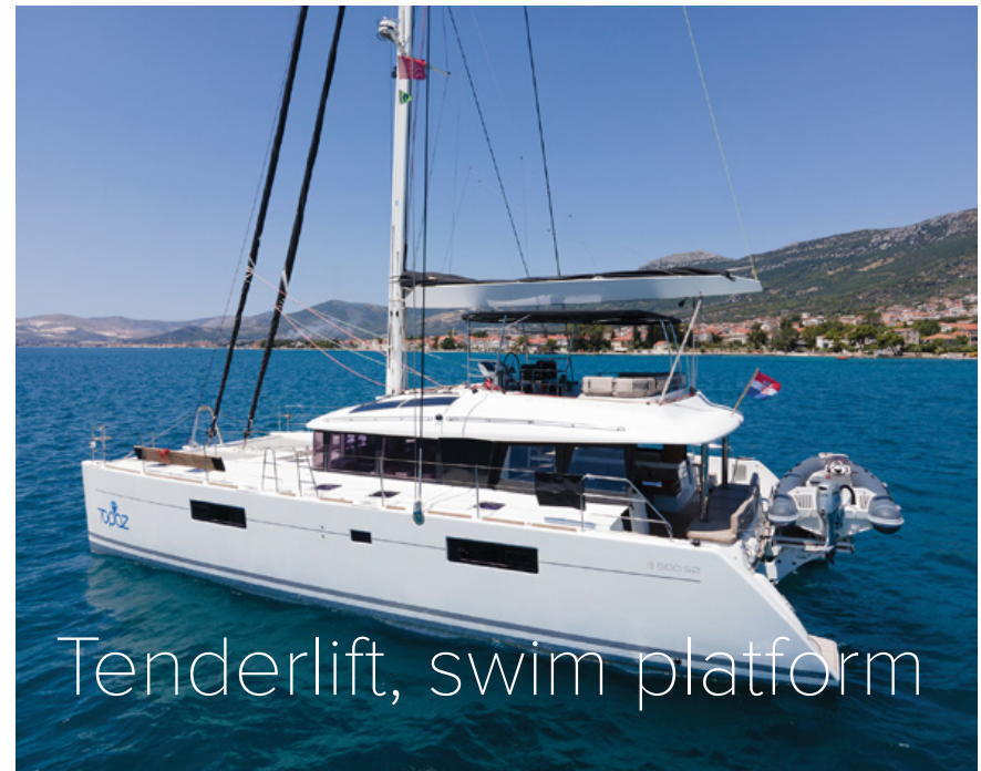
Tenderlift, swim platform