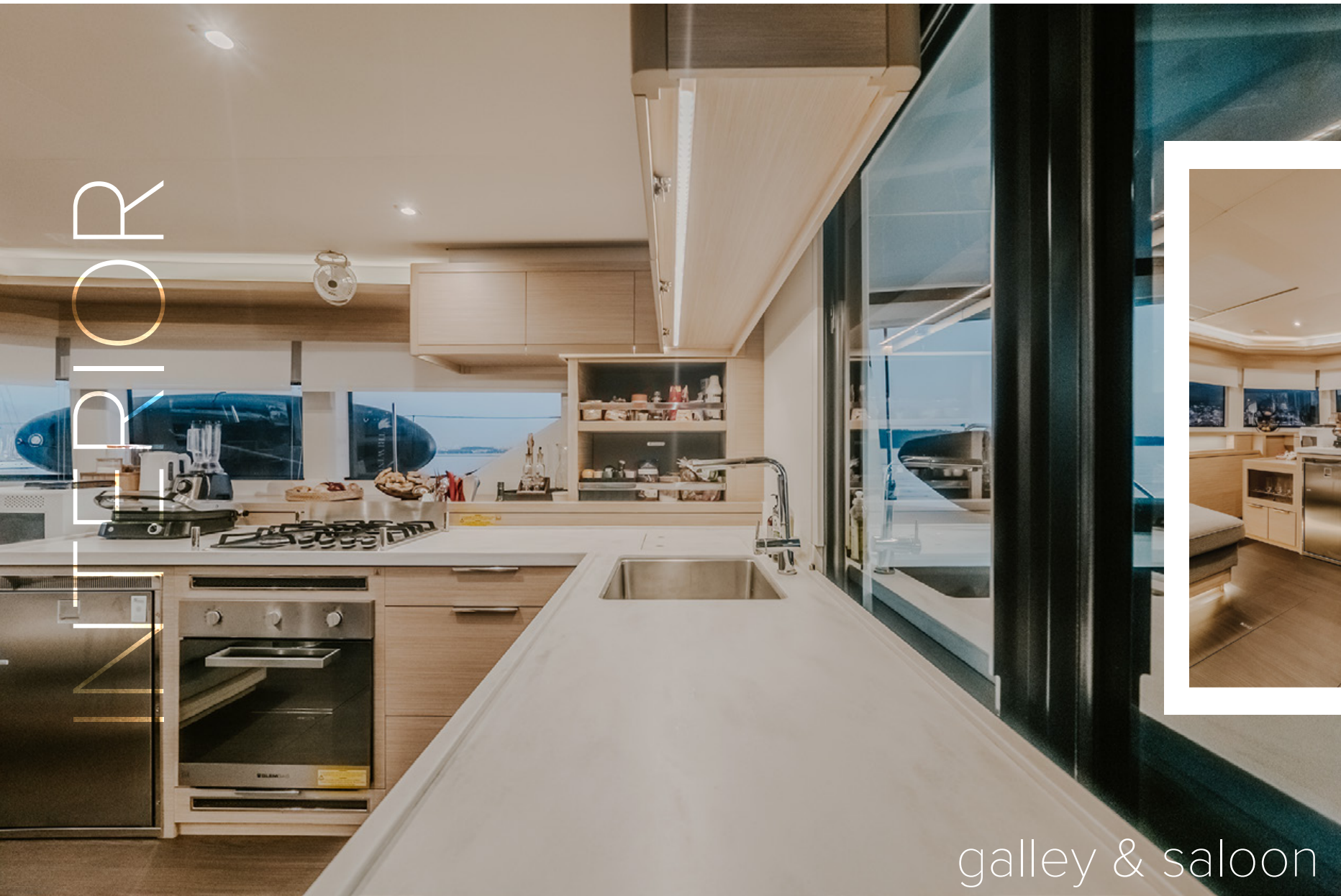
galley & saloon