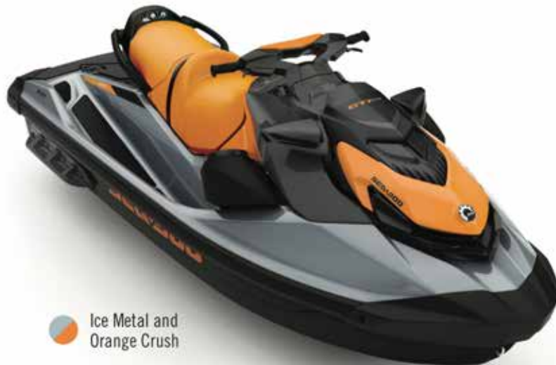
Ice Metal and Orange Crush